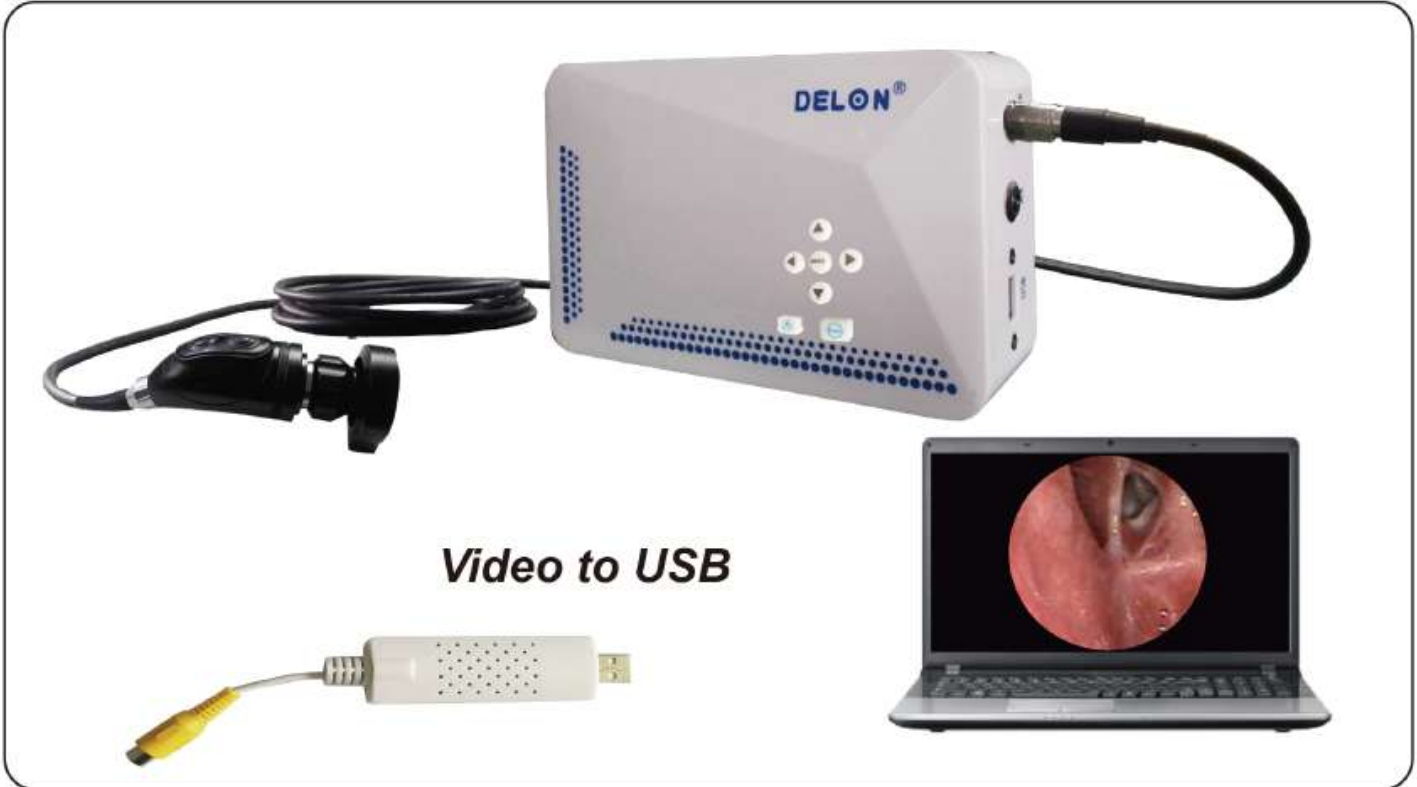
Video to USB